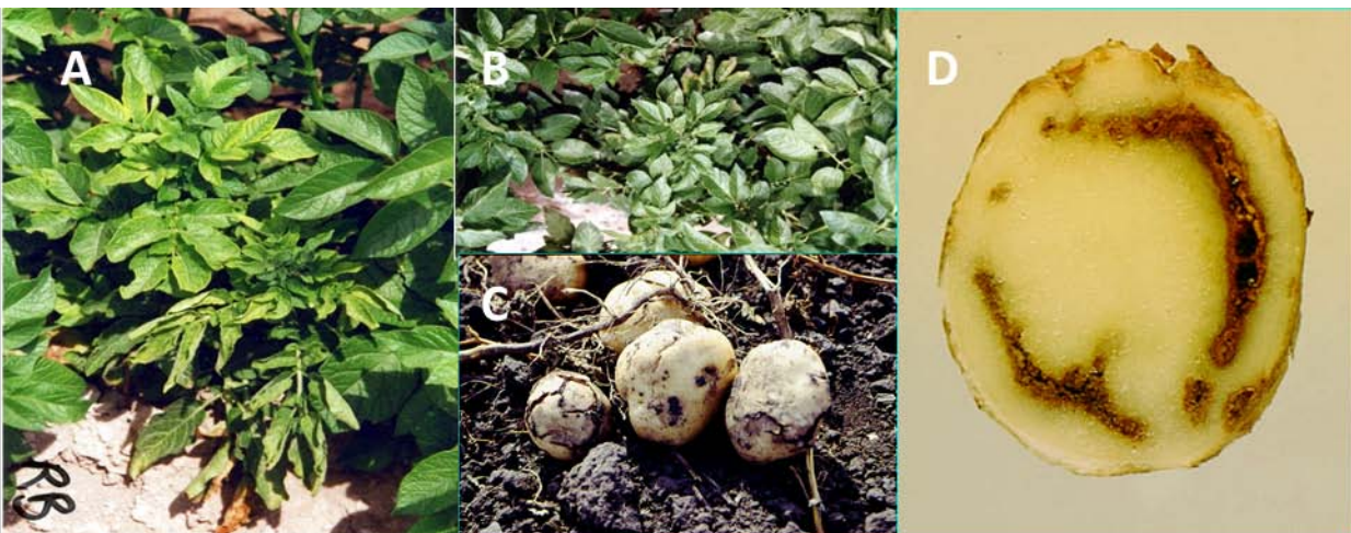
Figure 1. Symptoms associated with Bacterial Ring Rot (BRR) of Potato. A. Potato plant infected with BRR displaying foliar wilt, chlorosis and stunting. B. "Dwarf rosette symptom of BRR seen in some varieties. C. Tubers showing surface cracking typical of BRR. D. Tuber showing deterioration of the vascular tissues caused by BRR infection.

Bacterial Ring Rot of potato (BRR) is a vascular pathogen that is characterized by a foliar wilt and a rot that affects the vascular ring in the tuber. Often the first symptom observed in the field is the sudden wilt of a single stem on a single plant, a symptom referred to as "flagging," though the wilt can also affect the entire plant. Some varieties suffer from shortened internodes and mild chlorosis (yellowing) in the upper part of the plant, a symptom referred to as "dwarf rosette." Tuber symptoms range from a slightly yellow discoloration of a portion of the vascular tissues to the complete deterioration of the vascular ring. Secondary invaders such as bacterial soft rot can rot out the entire center portion of the tuber, leaving behind a hollow shell consisting only of the intact tissues from the vascular ring outward. Surface cracking on tubers is frequently but not always observed as well. In both infected stems and infected tubers, the vascular tissues become clogged with large numbers of the BRR bacterium and squeezing the tuber or stem to look for "bacterial ooze" is a field diagnostic technique that is used routinely. Because foliar wilt and vascular discoloration can be caused by diseases or conditions other than BRR, a laboratory test for confirmation is highly recommended.