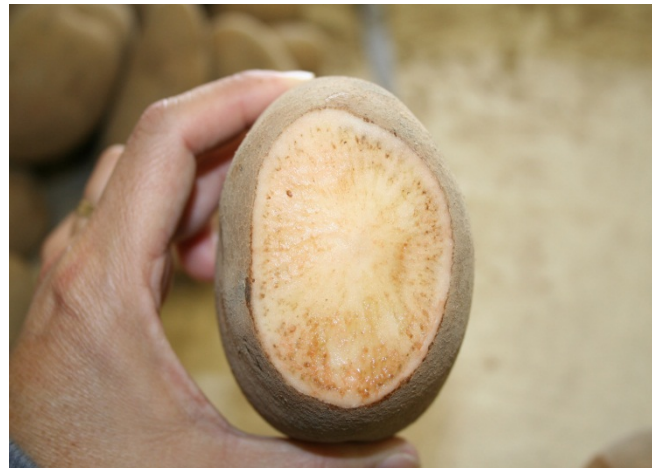
Figure 1 ZC tuber symptoms.

The potato psyllid is a phloem-feeding insect that has an extensive host range of at least 20 plant families, but reproducing mostly on the potato and nightshade family (Solanaceae). This insect has been very costly to cultivated solanaceous crops in the United States, Mexico, Central America, and more recently in New Zealand. In recent years, a new potato tuber disease, zebra chip (ZC), has caused millions of dollars of losses to the potato industry in the southwestern United States, particularly Texas. However, ZC was for the first time documented in Idaho and the Columbia Basin of Washington and Oregon late in the 2011 growing season. This disease is characterized by development of a dark striped pattern of necrosis in tubers (Fig 1). The pathogen associated with ZC is the bacterium Candidatus Liberibacter solanacearum that is vectored by potato psyllid.