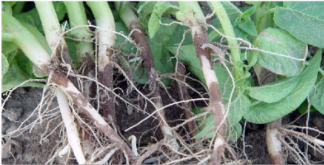
Figure 1. Stem canker on potato stems caused by Rhizoctonia solani AG3.