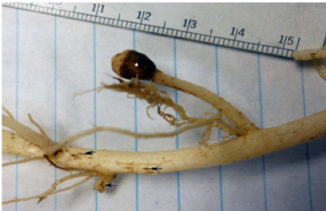
Figure 2. Stem canker lesions on a potato stem and stolons caused by R. solani AG2-2IIIB.