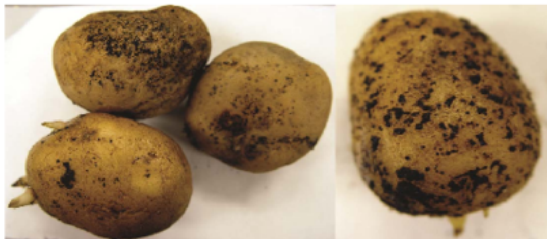
Figure 3. Black scurf on potato tubers caused by Rhizoctonia solani AG3.