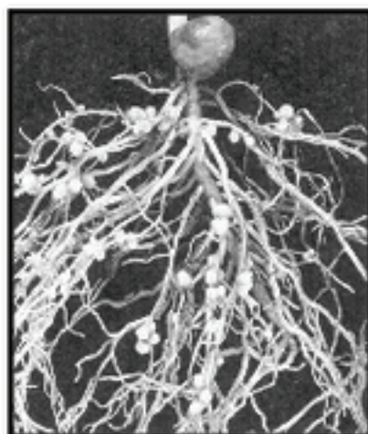
Alfalfa root nodules, containing nitrogen fixing Rhizobium bacteria.

Applied N would most likely be needed for alfalfa establishment following small grain production in which the residue is returned to the soil. In this situation, microbes will utilize available soil N to break down resi-