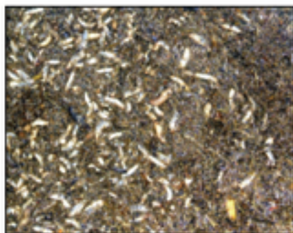
Black soldier fly larvae digesting dairy manure

Idaho is ranked 3rd in the nation for milk production, with an estimated 549,000 dairy cows in the state (USDA-National Agricultural Statistics Service, 2008). Each dairy cow produces approximately 20 lbs of dry matter manure per day, which adds up to 5,490 tons of dry matter dairy manure produced daily in the state. Although Idaho has a large land base to apply manure to, the majority of dairy manure is applied in close proximity to the dairy. Re-