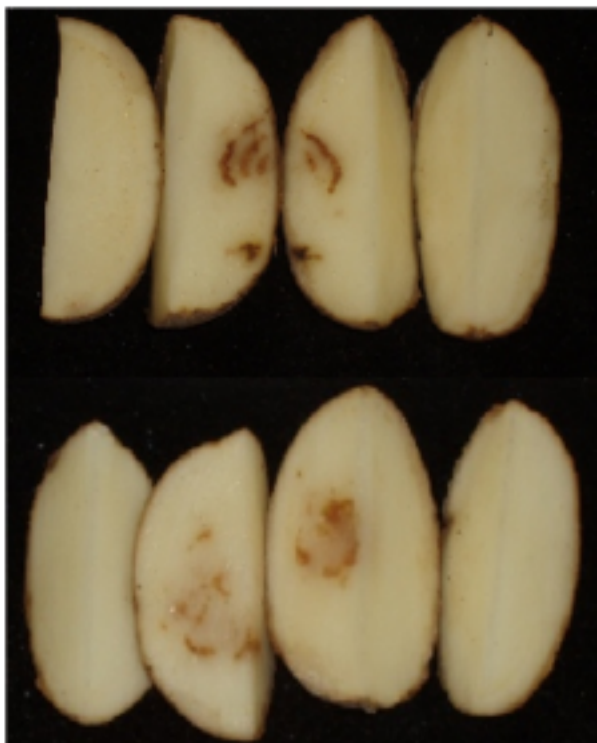
Figure 1. Example of internal symptoms observed in tubers from the 2012 PMTV trial in the Columbia Basin. Both of these tubers tested positive for PMTV.

Xu, H. T.-L. DeHaan, and S.H. De Boer. 2004. Detection and confirmation of Potato mop-top virus in potatoes produced in the United States and Canada. Plant Dis. 88:363-367.